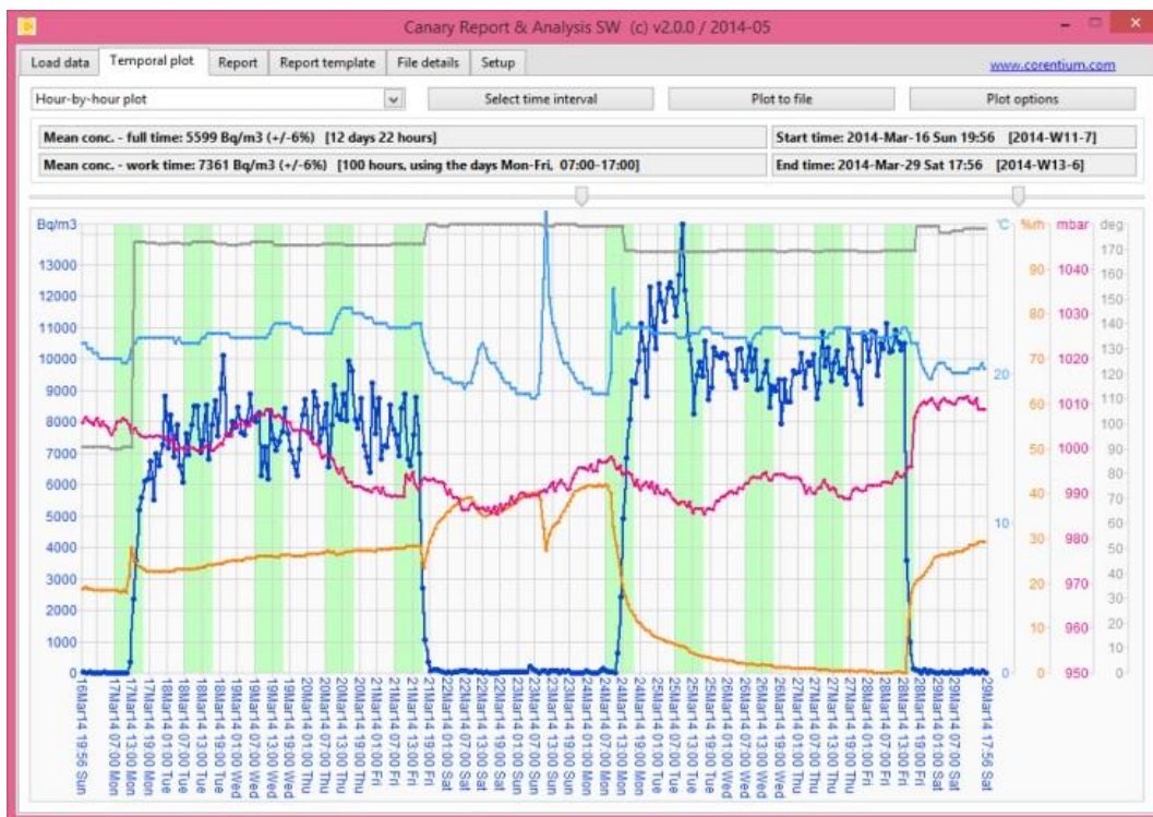
Screenshots of measurement data plots from the CRA Software